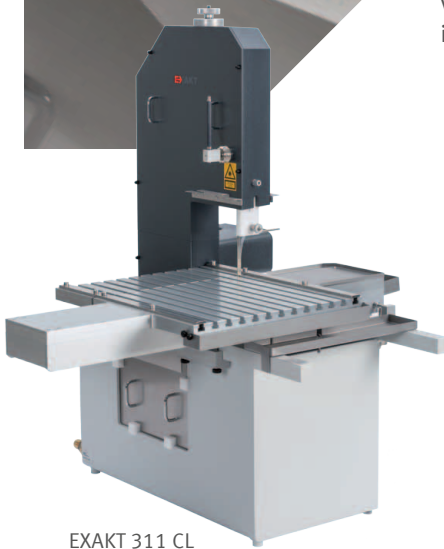
EXAKT 311 CL