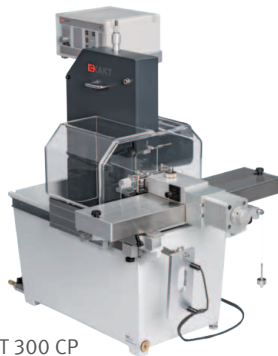
EXAKT 300 CP