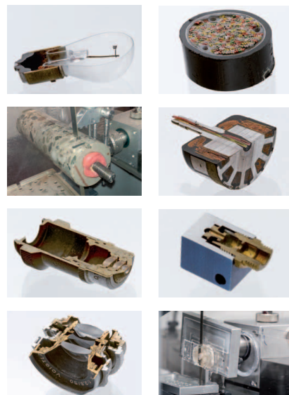
Examples of sample cuts made in Quality Control and R&D